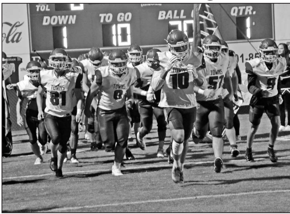
The Indians take the field one final time during the 2020 season.

The Indians won the coin toss in Wilkes County last week and elected to defer until the second half, giving the Tigers the ball to start